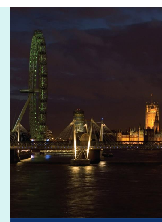
Institute of Education University of London 20 Bedford Way London WC1H 0AL

Tel +44 (0)20 7612 6000 Fax +44 (0)20 7612 6126 Email info@ioe.ac.uk Web www.ioe.ac.uk